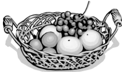
Basket A 12kg