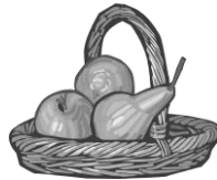
Basket B 8kg