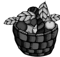
Basket C 16kg